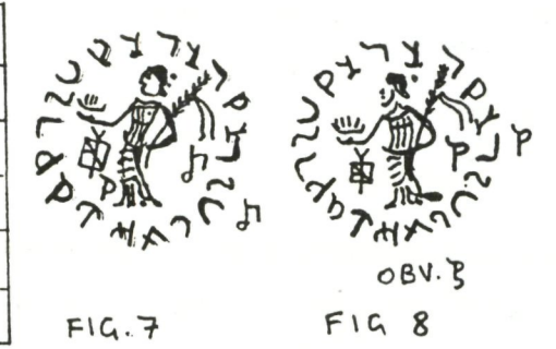
TABLE 4 ARACHOSIAN MINTS -NON A